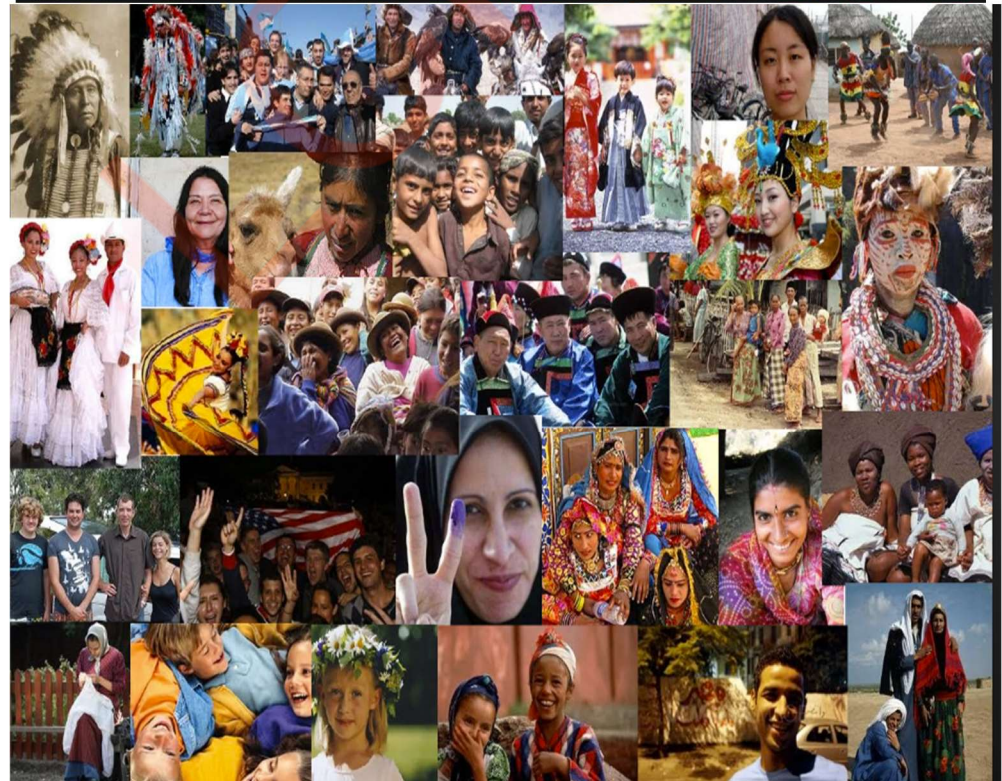
NO ONE IS EXEMPT FROM HEARING THE GOSPEL OF JESUS CHRIST